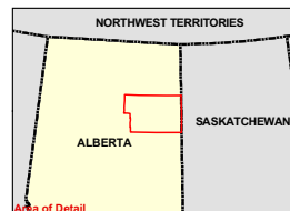
Figure 9-9: Fort McKay Proposed Protected Areas with Existing and Approved Development