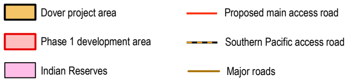
Figure 1. Regional setting